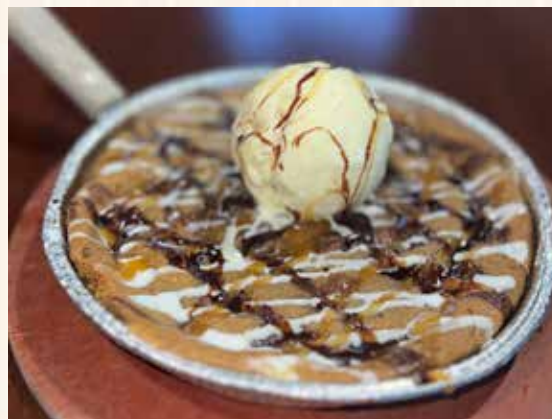
CHOCOLATE CHIP COOKIE PIZZA

Your choice of 12 pretzel bites, churro bites or doughnut holes. Tossed in butter and cinnamon-maple sprinkles. Served with your choice of caramel, chocolate, cinnamon sauce or hot honey – 9.49