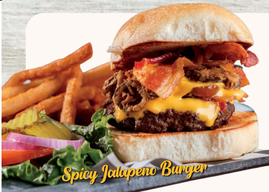
Spicy Jalapeno Burger