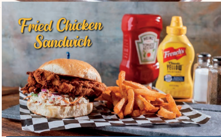
Fried Chicken Sandwich