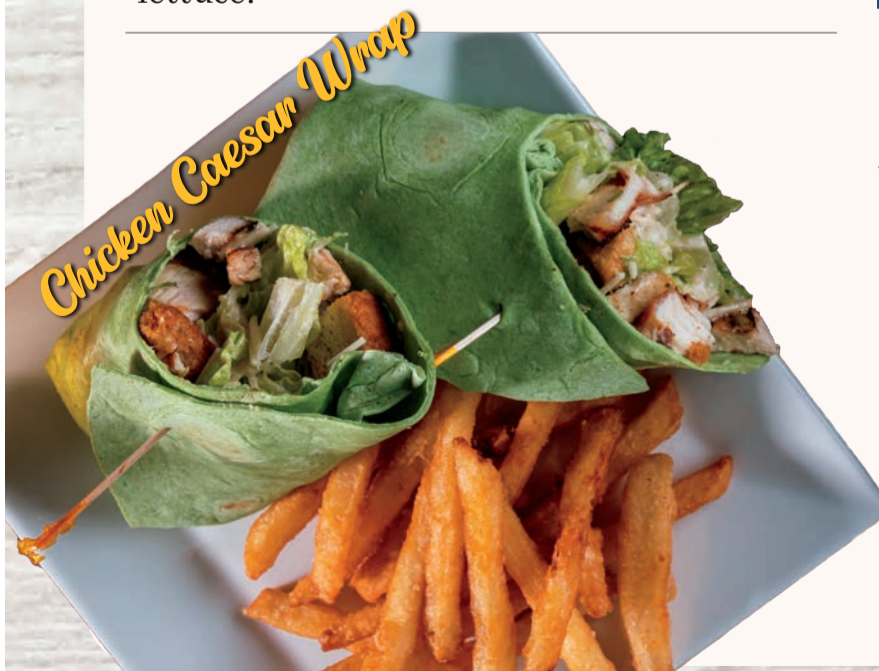
Chicken Caesar Wrap

A mild chipotle flour tortilla stuffed with sliced chicken breast & thick-cut smoked bacon. Topped with shredded cheddar cheese, ranch dressing, & shredded lettuce.